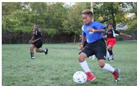
Sports & Games