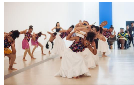
Arts, Music, Dance & Drama