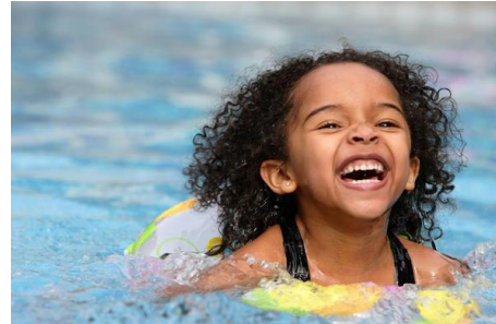
Field Trips & Events