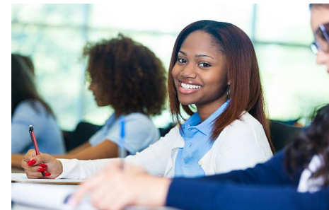
Youth Leadership Academy